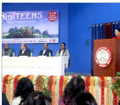
DigiTEENS : An Awareness Program for Internet Maturity