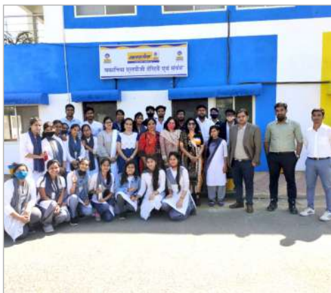
Industrial Visit Bakania LPG Plant