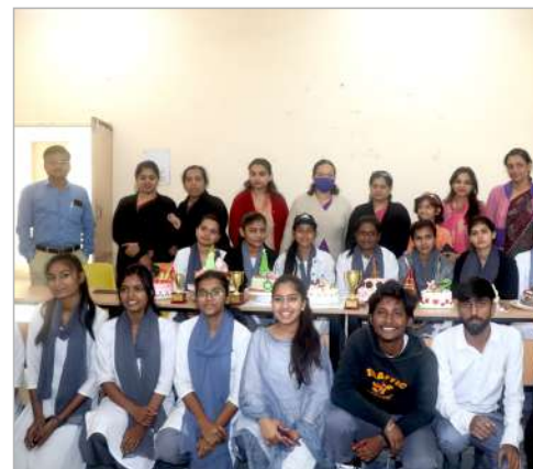
Cake Decoration Competition