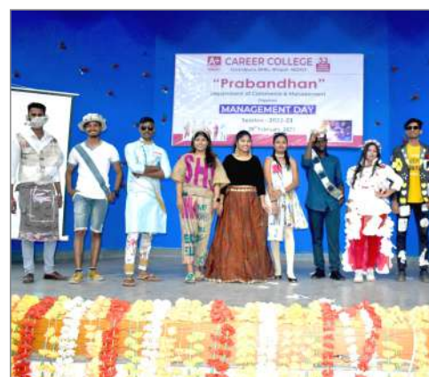
Management Day Celebration