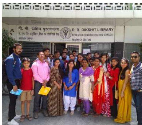
Visit to B.B. Dikshit Library, AIIMS, New Delhi