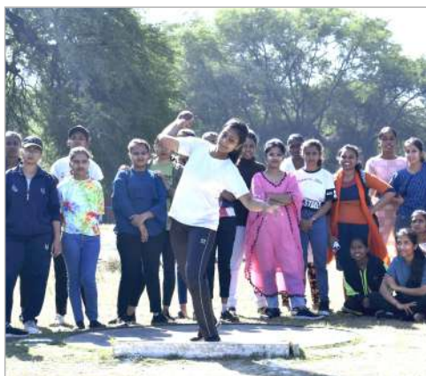
Shot Put Throw during Annual Sports Day