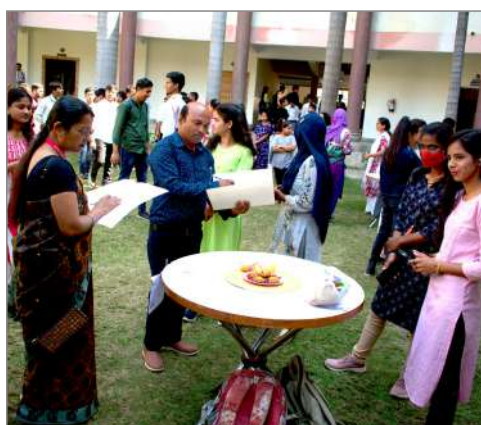
Mota Anaj Pratiyogita