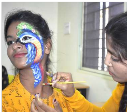
Face Painting Competition