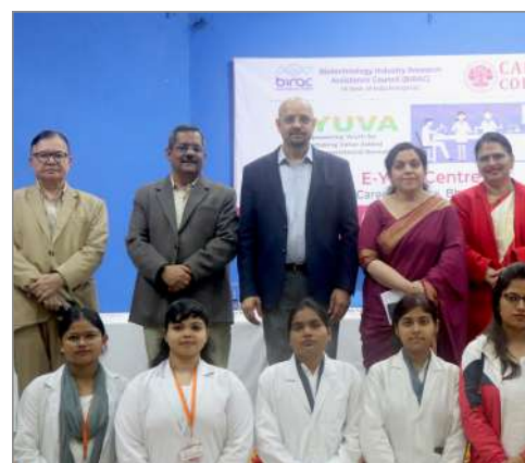
BIRAC E-YUVA CENTER