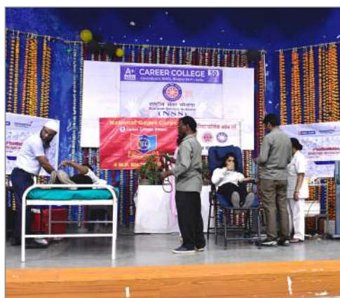
Blood Donation Camp by NSS Unit