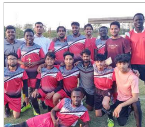
Career College Football Team