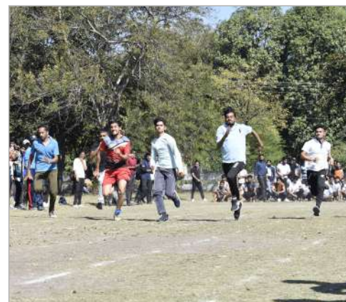
(400 Meters) during Annual Sports Day