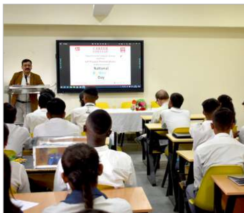
Science Day Celebration