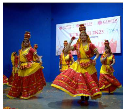
Dance Performance in Annual Day (Utkarsh)