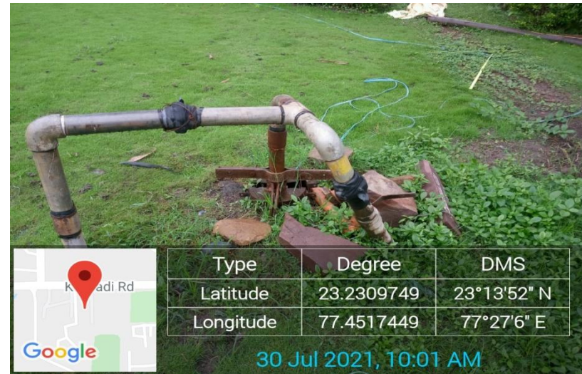
Borewell/Open Well Recharge