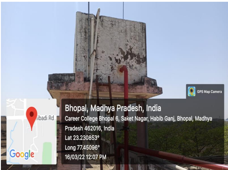
Construction of Tanks